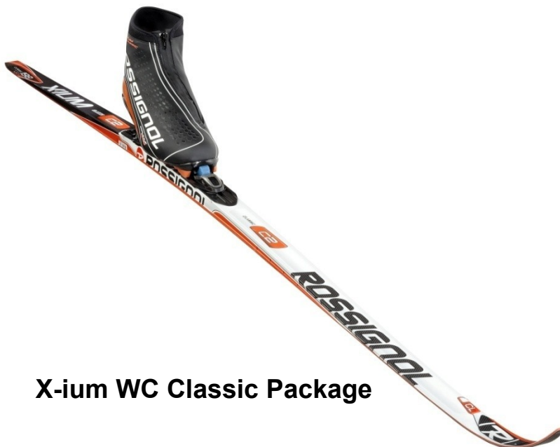
X-ium WC Classic Package