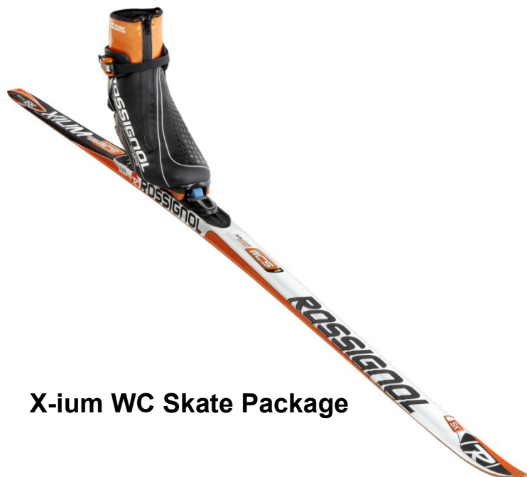
X-ium WC Skate Package