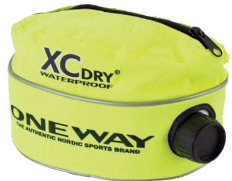
Thermo Belt XC-DRY