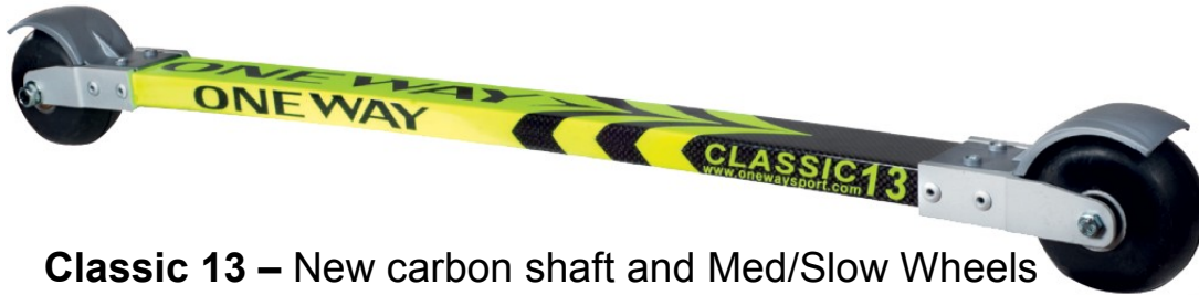
Classic 13 – New carbon shaft and Med/Slow Wheels – weight range 165-210#