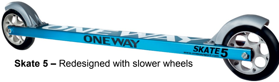
Skate 5 – Redesigned with slower wheels