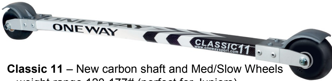
Classic 11 – New carbon shaft and Med/Slow Wheels – weight range 120-177# (perfect for Juniors)