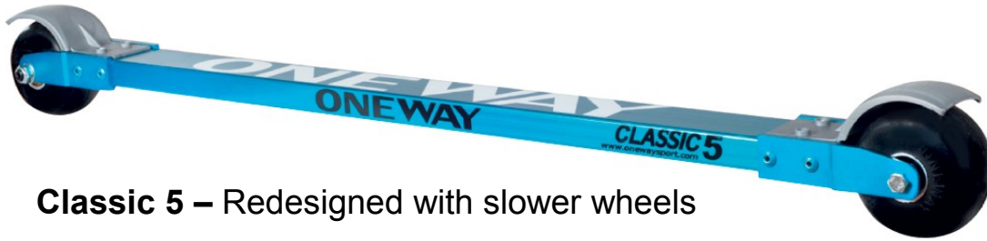
Classic 5 – Redesigned with slower wheels